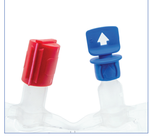
HCT50-HOSXR Red Shown